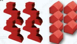
personal supply of 8 captains and 7 houses of your color at the start of the game (1 captain is on your clipper - step 8 - and 1 captain is on the rondel - step 10)

matching flag for your starting steamship: in this example, white for the ATLANTIC