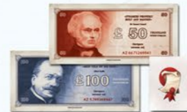
starting money £150 and 1 contract

6. Choose your color and take your set of components: - 10 captains and 7 trade houses as your personal supply, - 1 player board, - £150 and 1 contract, - 1 play aid.