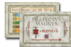
1 Praefectus Magnus/Pantheon

132 wooden pieces in player colors red, green, yellow, blue, black, and white; per player: