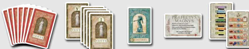
102 personality cards