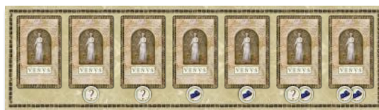
1 card display (2 puzzle pieces)