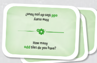
21 Question cards