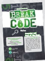
1 Rule booklet