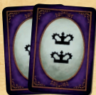
an additional set of special cards