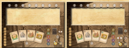
side for 2 or 5 players