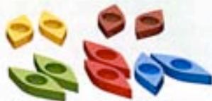
Figure 1: Illustration of game contents