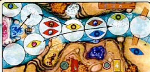
Figure 5a: Yannick YELLOW played his number 4 paddle card. As both his canoes are on the river, he must move both canoes. He first chooses to move his empty canoe 2 spaces toward the waterfall and there uses his third and fourth movement points to pick up the gem there. Then, he moves his other canoe four spaces toward the dock.