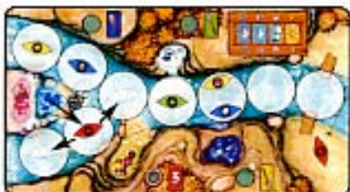
Figure 7d: He also could choose to pick up the blue gem (for 2 movement points) from the river bank where his empty canoe was, and then move one space with the blue gem.