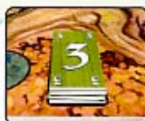
Figure 3c: On each player's card space on the board, lies the player's last played card. Previously played cards lie under these cards.

During the game, the face-up paddle cards of each player create a discard stack on their spaces on the game board. The players place each new card on top of the stack so the numbers on the cards under it cannot be seen (see figure 3c). Once played, cards remain on the game board until all 7 cards for a player have been played (and used). After 7 rounds, the players take back all 7 of their cards from the game board.