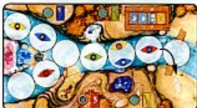
Figure 7a: Roger RED plays the number 3 paddle card. He moves one of his canoes (with a gem) to the dock, and can unload the gem, placing it in his play area.