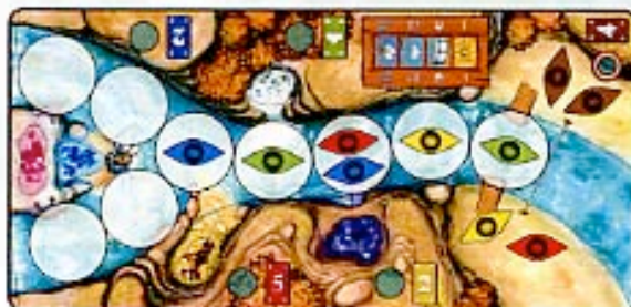
Figure 4: Bea BROWN may only move one of her canoes, as both are on land. Yanick YELLOW and Roger RED must move their canoes that are already on the water and may also move their second canoes that are on land. Biggi BLUE must move both her canoes as they are both on the water. Gina GREEN would also have to move both her canoes, but she played a cloud, and moves no canoes. Instead, she moves the cloud marker on the weather track (see page 6).