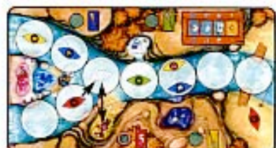
Figure 7f: He chooses the last possibility: moving 1 space up-river and using his remaining 2 movement points to pick up the red gem on the river bank there.