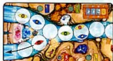
Figure 7c: If he chooses to move 3 spaces down-river, he will go over the waterfall, which he certainly does not want!