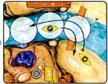
Figure 8: Getting into the river, players have to move the entire paddle distance. Moving to the docks, players may waste paddle points.