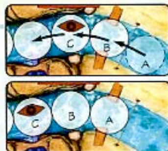
Figure 10a and 10b