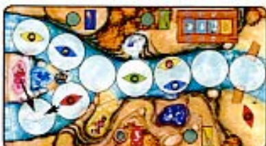
Figure 7e: Roger RED could also move 1 space down-river, and use his remaining 2 movement points to pick up the red gem from the river bank there.