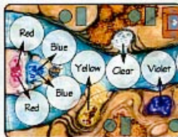
Figure 6: Unloading at the red discovery place, a canoe must be on the last river tile before the waterfall to either the left or right of the tongue of land. Unloading at the blue discovery place, the canoe can be both on the left and right side along the tongue of land. Unloading at the yellow discovery place, the canoe must be on the merging river space and so on.

Along the bank of the Niagara River, there are three different discovery places where gems can be found. There are also gems on two places on the land tongue. To load or unload a gem, a player must have one of his canoes on the river space next to the space with the gem. Each space with gems corresponds to a specific river space (see figure 6).