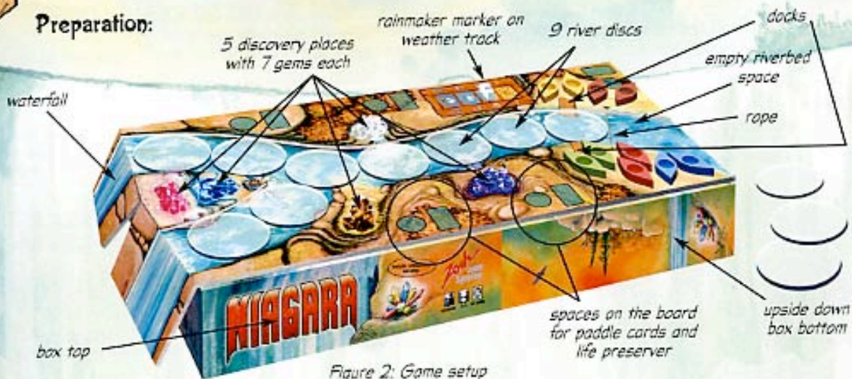
Figure 2: Game setup