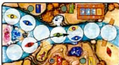
Figure 7b: He could move his other canoe (empty) up-river 3 spaces, and there can steal a gem from either Yannick YELLOW or Biggi BLUE.