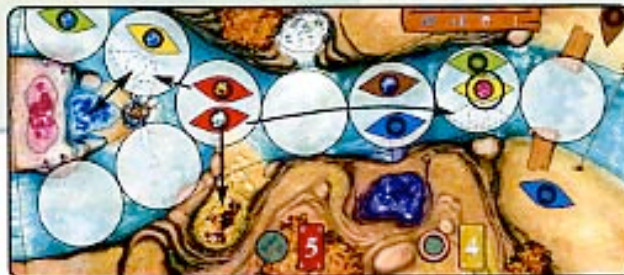
Figure 5b: Roger RED played his number 5 paddle card. He moves his canoe 1 space down-river. Now, he unloads the yellow gem (two paddle points) and loads a blue gem in this turn (two paddle points). With his second canoe he unloads a clear gem in the yellow colored discovery place first (two paddle points) and then moves his canoe 3 spaces up-river to steal the red gem from Yannick YELLOW's canoe (see page 5: "Stealing gems").