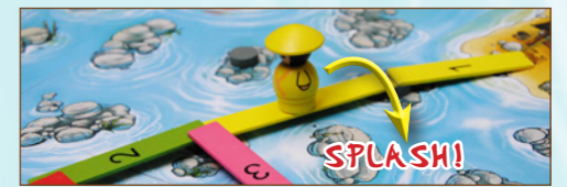
Example 4: There is no pawn the yellow one can jump over. He misses his jump, falls in the river and goes back to his starting village.