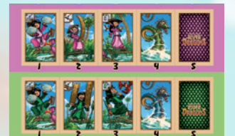
Example 5: The pink player placed a green dragon in 4th position, the green player placed a blue dragon in 4th position. The green dragon does not cancel the blue dragon. The blue player won't be able to play his 4th action.

In a setting with less than 6 players, each player removes the dragons of the absent colors from his hand.