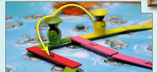
Example 3: The yellow pawn must jump over another pawn. Here, it can only jump over the green pawn and land on the red plank because there is no other pawn next to him.