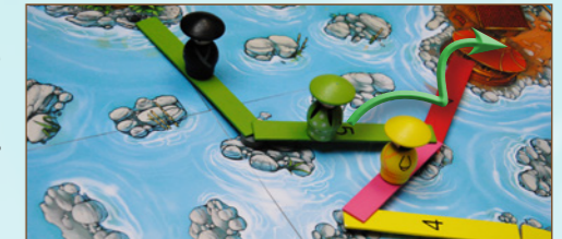
Example 2: The green pawn must move up two planks. Here, all the planks around are occupied by other pawns, he can only reach the red village or come back on the plank he is already standing on.