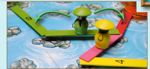
Example 1: The green pawn must move on a free adjacent plank. Here, he can go on the green plank on his left or on the red plank on his right. He cannot go on the pink plank already occupied by the yellow pawn.