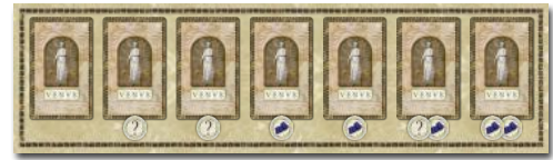
1 card display (2 puzzle pieces)